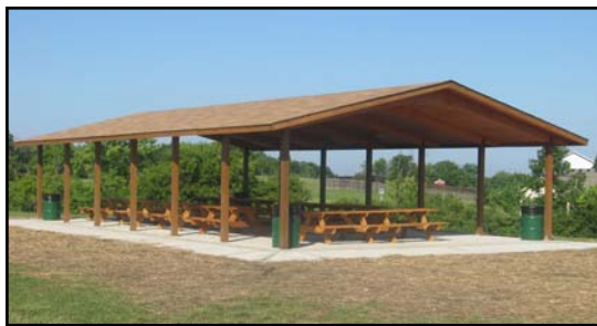
The new shelter at Fort Liberty Playland, constructed last summer.

Park shelter reservation forms can be found on the web site or contact Vickie Daniel at 759-7500 to check availability and learn more.