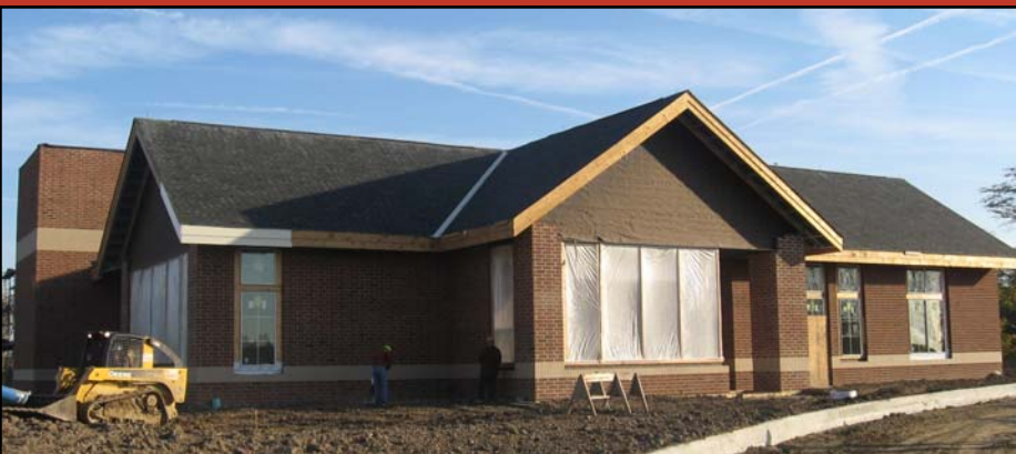
Construction on Fire Station 111, located on State Route 747 at Kyles Station, continues on schedule. The building is taking shape nicely with the majority of the masonry completed and the windows going in next. Fire Station 111 is expected to be complete in December/early January.

We also serve as a referral agency of sorts, often fielding questions, offering suggestions or referring residents to other agencies in a wide array of topics. After all, many people think about their local fire department first when they don't know where to turn for assistance or information. Obviously, always call 911 first in the event of any emergency to life or property, but we are more than willing to offer advice or assistance in other matters as well. We can be reached at 513.759.7530.