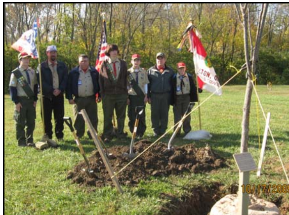
Boy Scout Troop 946 led the Liberty Tree Memorial ceremony

made the Liberty Tree Memorial possible. The tree will serve as a living, growing tribute to our country's freedom and founding.