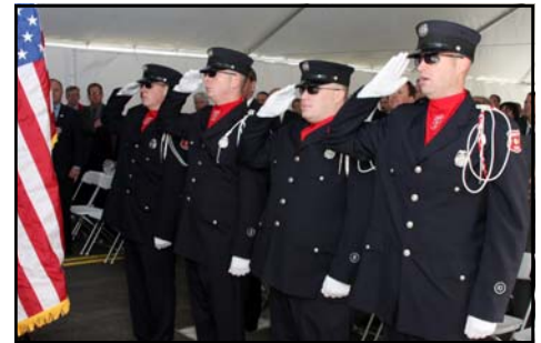
Liberty Twp Fire Department Honor Guard