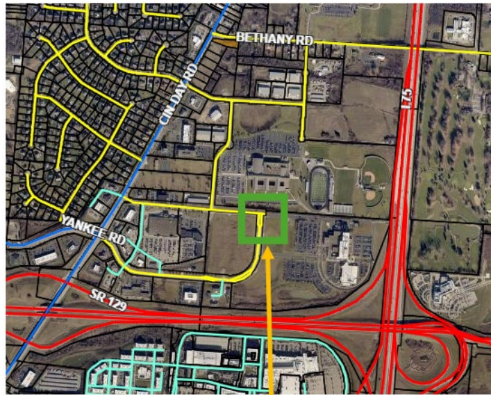
Intersection of Yankee Rd. and Liberty One Dr.