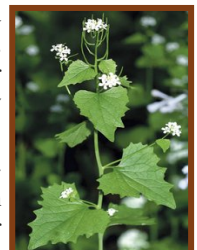
Second Year Bloom & Leaf