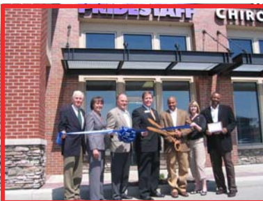
Pridestaff Ribbon Cutting April 2, 2009

Suburban Pediatric Associates has opened their 7,000 square foot pediatrics office in the Liberty Commons Medical Center on Yankee Road and State Route