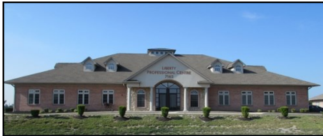
The Township's Administration offices will move to this building at 7162 Liberty Centre Drive, Suite A, this summer. The new offices are located near the SR 129/Cincinnati-Dayton intersection on Liberty Centre Drive just up the road from the Shell Gas Station and McDonald's.

The new location is 6200 square feet, an increase of about 1500 square feet, and provides additional offices, increased storage and conference space and a more functional working environment. Aging mechanics and a dated septic system at the Township's current location spurred the need to begin identifying a temporary solution sooner than originally anticipated. The temporary lease will provide Liberty Township the time it needs to determine its long-term facility strategy and plans – a project currently underway. Interviews are being conducted to identify an architectural/design team to lead the Township through a facility master planning process.