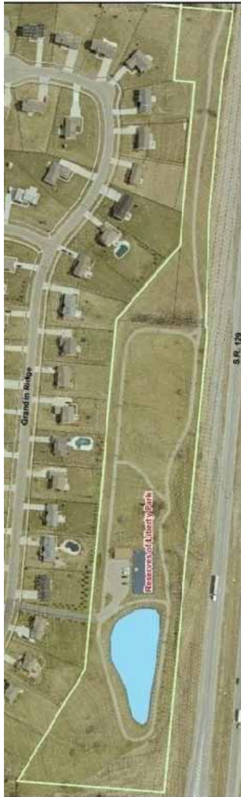
Figure 12: Reserves of Liberty Park