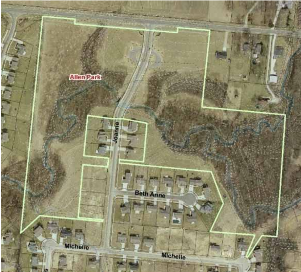
Figure 9: Allen Park