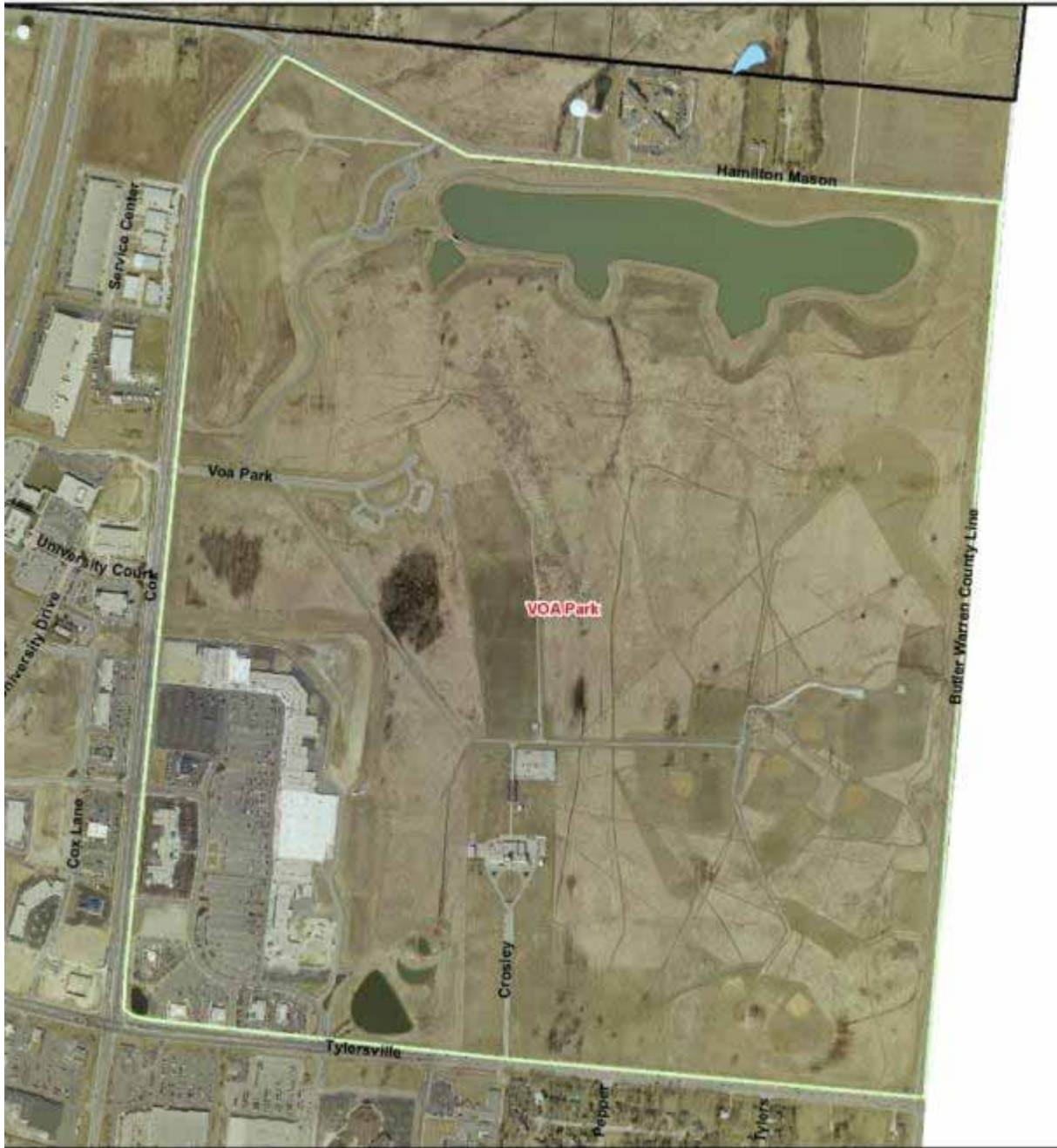
Figure 18: Voice of America Park