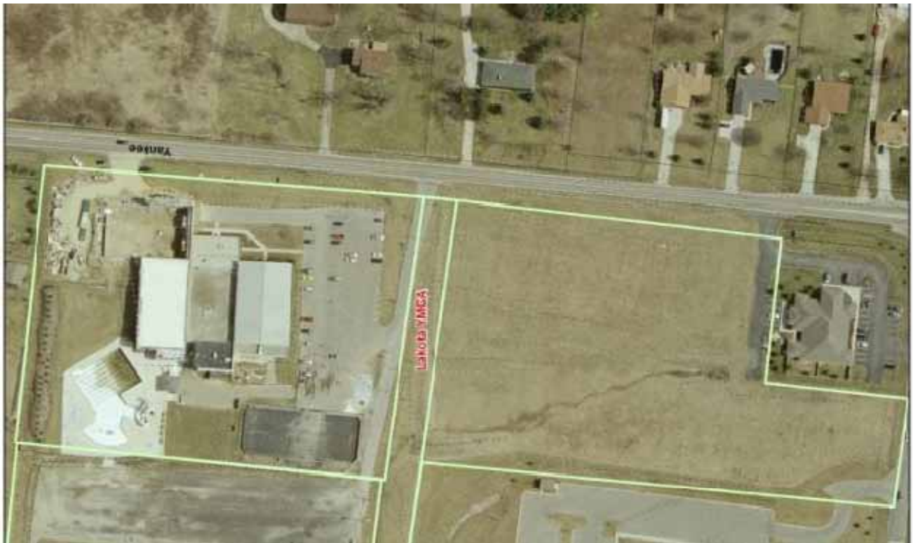
Figure 20: Lakota YMCA