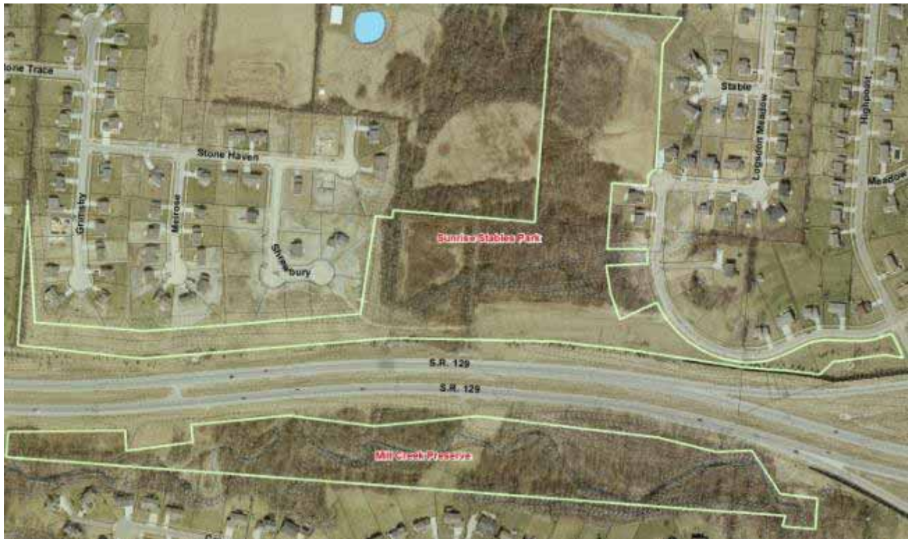
Figure 13: Mill Creek Preserve and Sunrise Stables Park