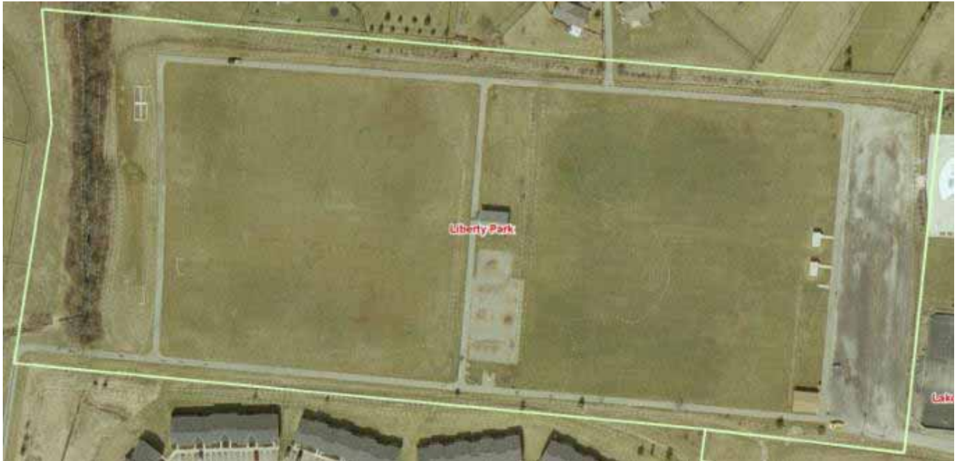
Figure 7: Liberty Park