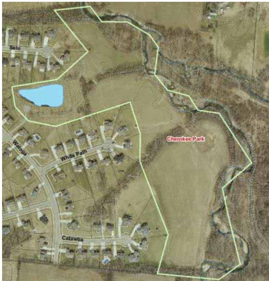
Figure 5: Cherokee Park