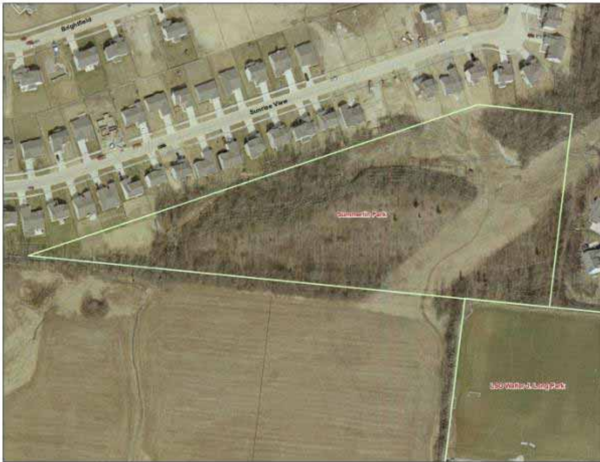
Figure 14: Summerlin Park

Site location – Summerlin Park is located adjacent to the LSO Walter Long Athletic Complex and there is no direct access into this site. It is located behind the subdivision streets.