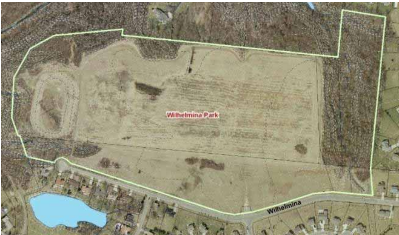
Figure 15: Wilhelmina Park