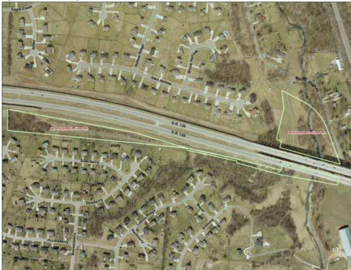
Figure 11: Maud Hughes Incline