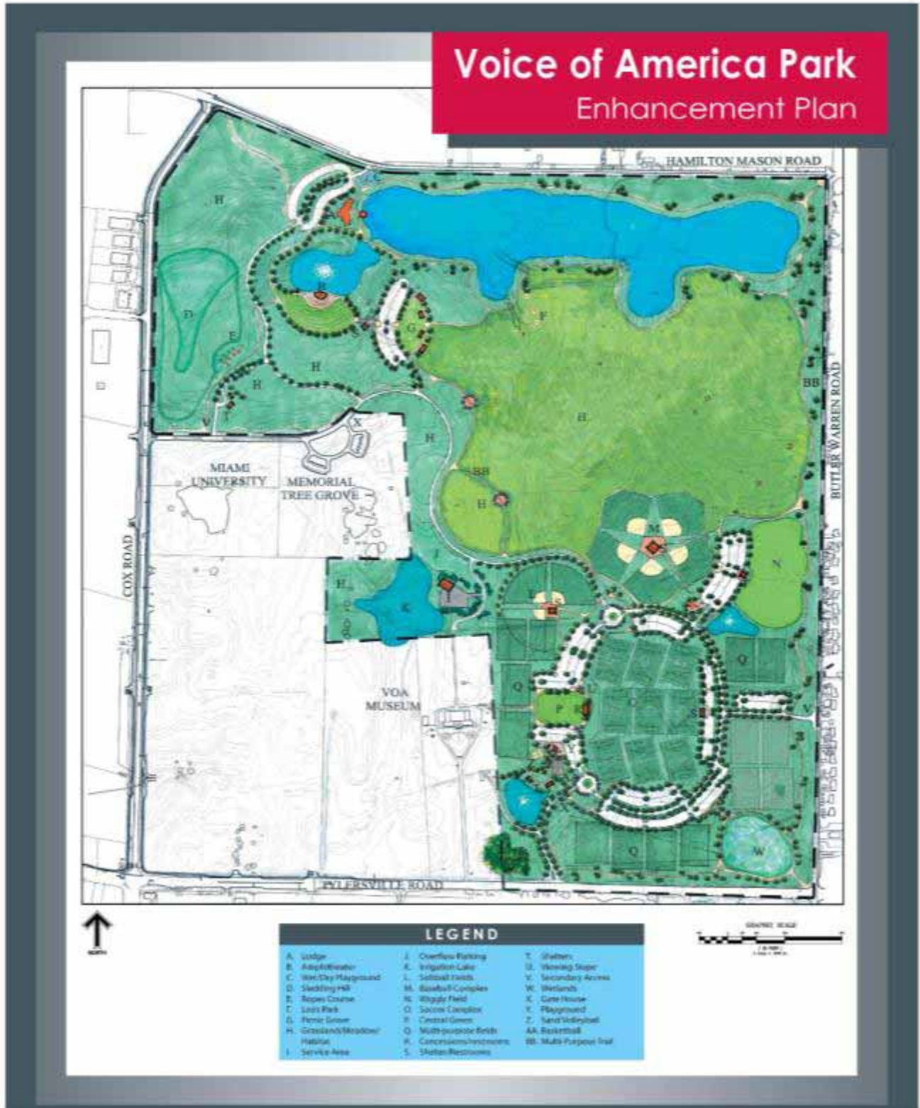
Figure 19: VOA Park Enhancement Plan