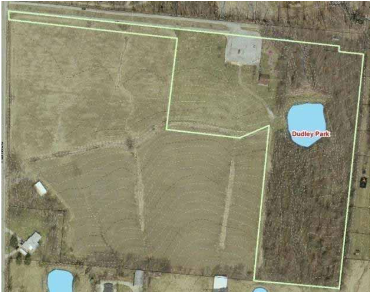
Figure 6: Dudley Memorial Park