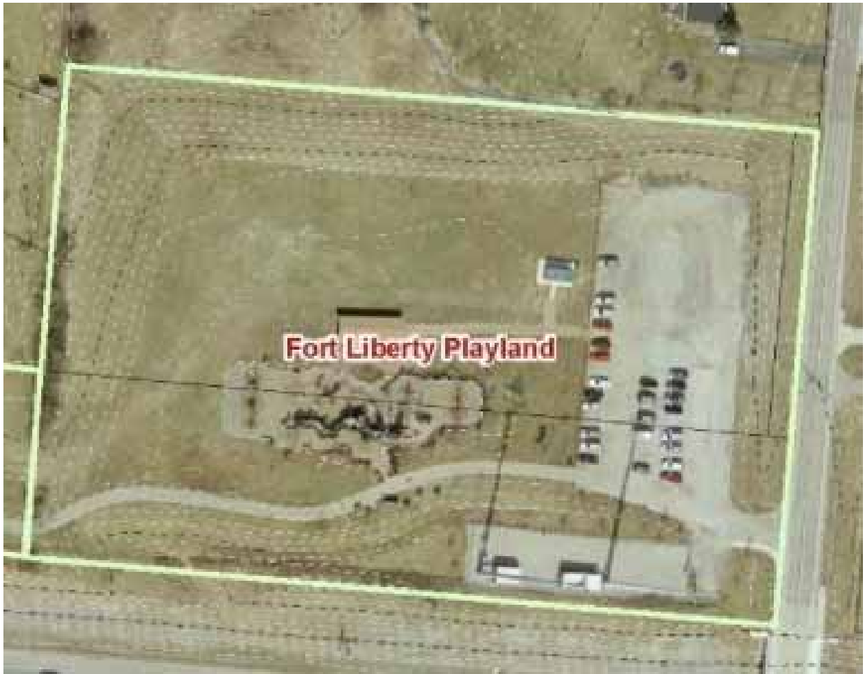
Figure 10: Fort Liberty Playland