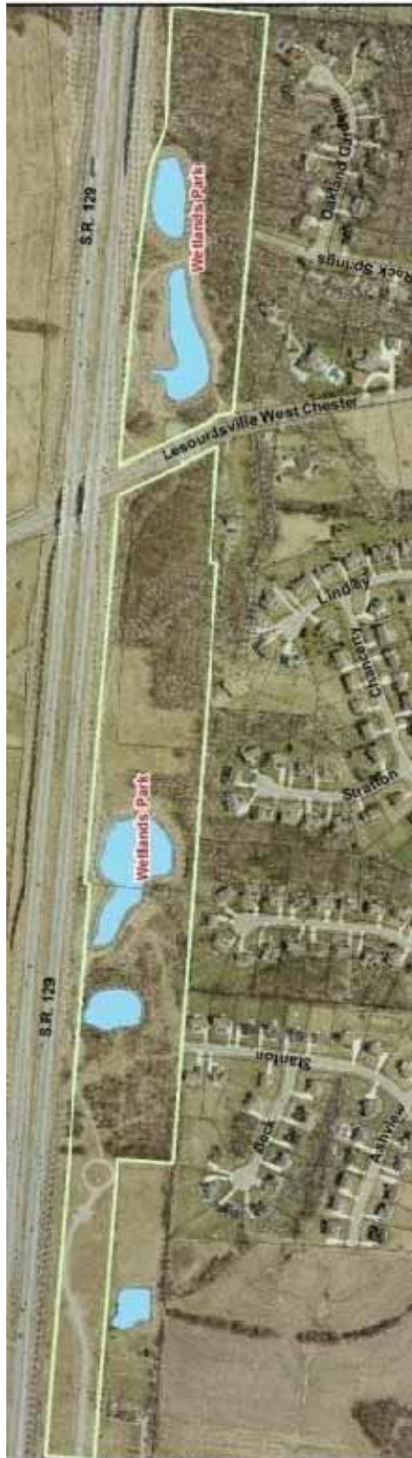
Figure 8: Wetlands Park